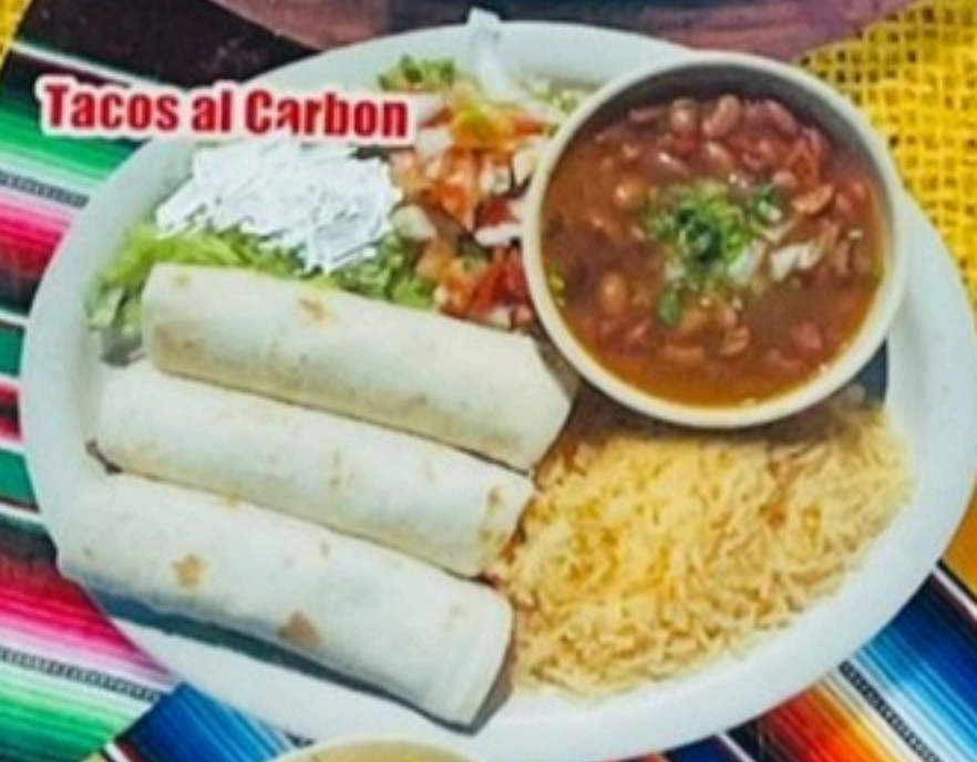
Tacos al Carbon

BISTEC A LA TAMPIQUENA $10.99 BEEF STEAK AND TWO CHEESE ENCHILADA