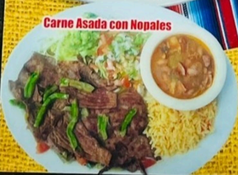
Carne Asada con Nopales

BEEF, CHICKEN, SHRIMP & MEXICAN SAUSAGE SERVED WITH RICE, CHARROS BEANS, GUACAMOLE SALAD & TORTILLAS