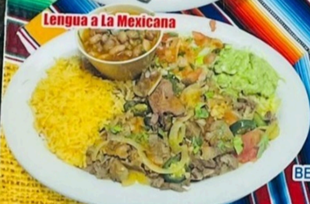
Lengua a La Mexicana