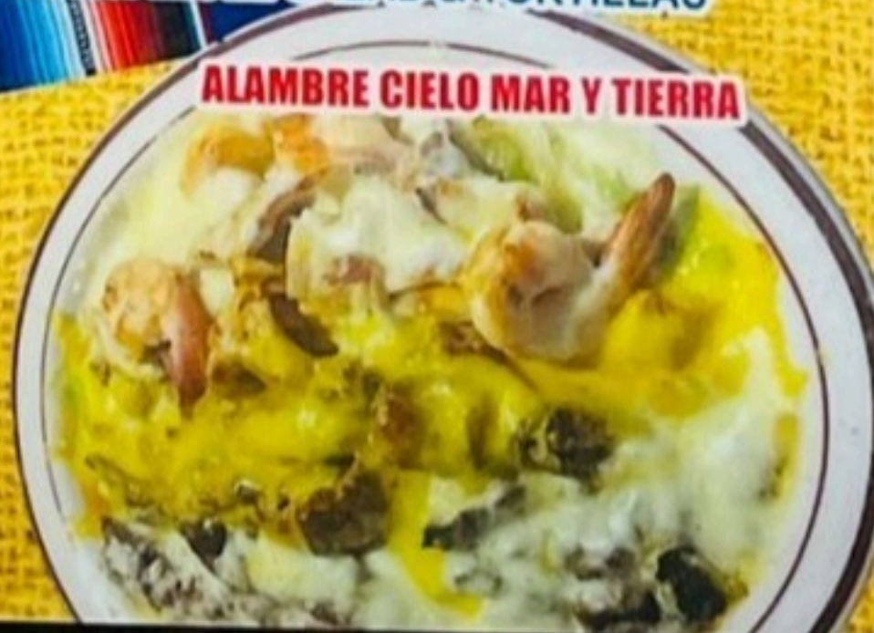
ALAMBRE CIELO MAR Y TIERRA