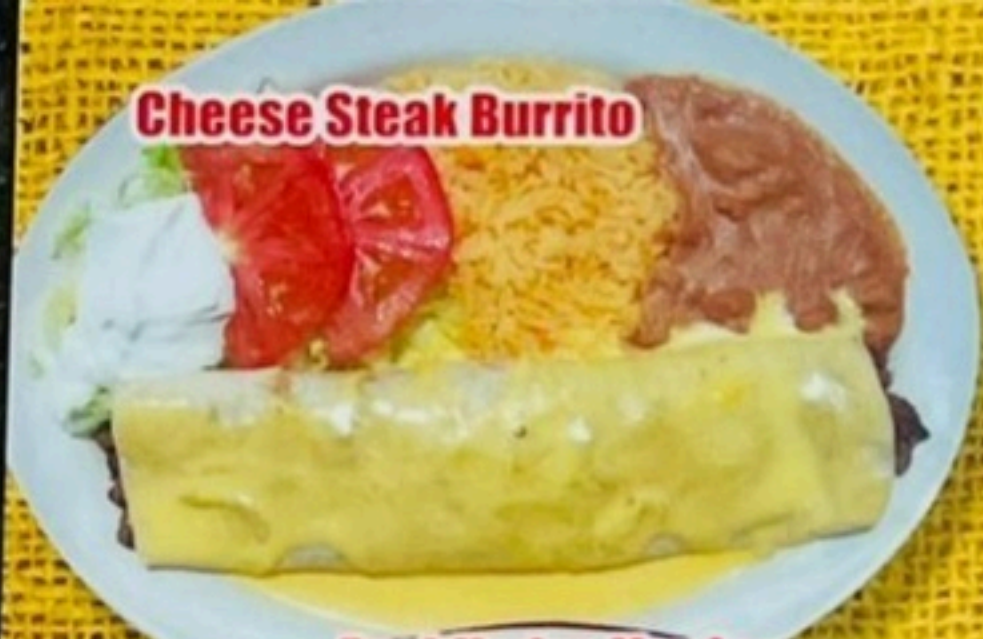
Cheese Steak Burrito